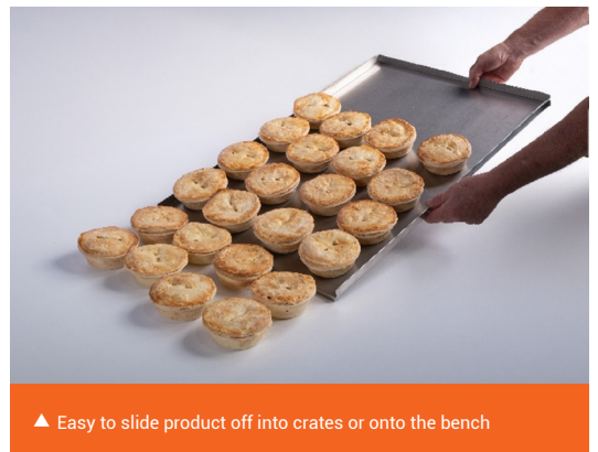
▲ Easy to slide product off into crates or onto the bench

Investing in a Pieline Food-Safe Baking Tray is a durable solution.